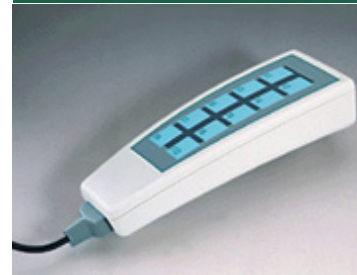
Pre-fitted Cable Glands