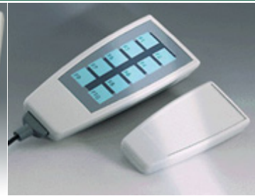
Top Recess for Keypads